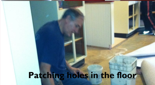
Patching holes in the floor