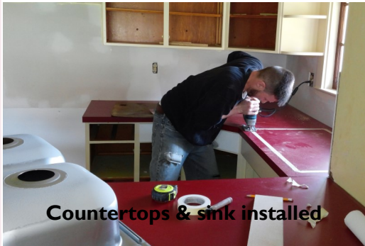
Countertops & sink installed