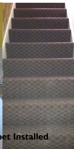
New Carpet Installed