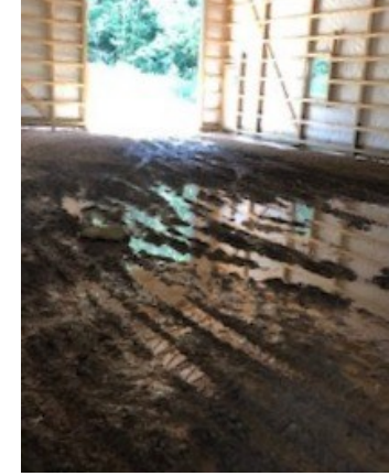
Inside as of June 24, 2020